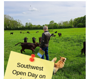
Southwest Open Day on Aine Ni Chonaill's Farm in Limerick