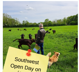
Southwest Open Day on Aine Ni Chonaill's Farm in Limerick