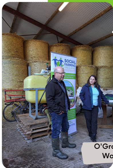
O'Grady's Farm Waterford