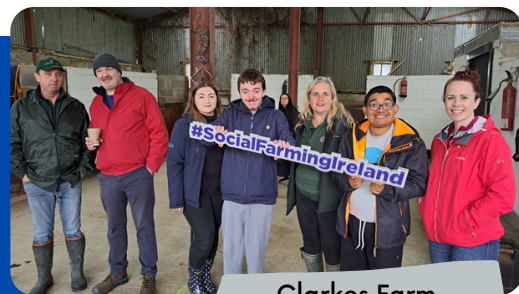
Clarks Farm Meath

Social Farming Ireland was delighted to have participated in the all Ireland Social Farming Awareness Week from the 3rd to the 7th October. During this week 5 Farms hosted exciting open days on their farms: