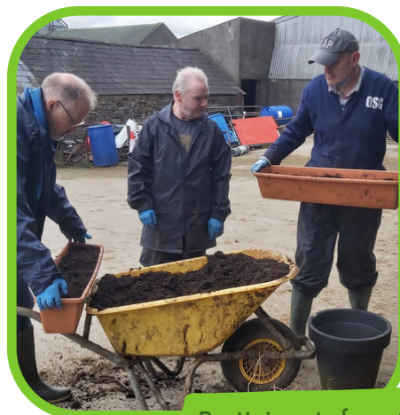
Participants from St. Christopher's Services on Whities Farm in Longford