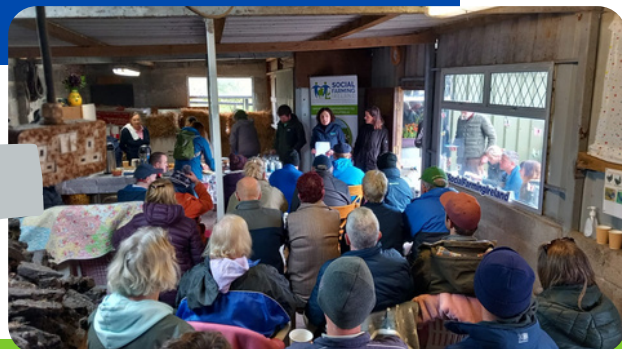
Murphys Farm Galway