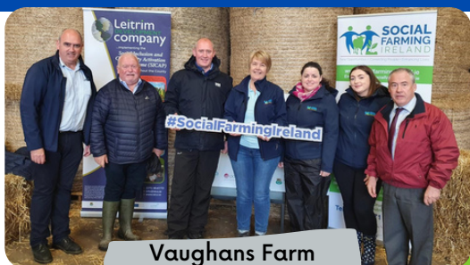
Vaughans Farm Donegal