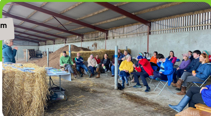
Batemans Farm Cork